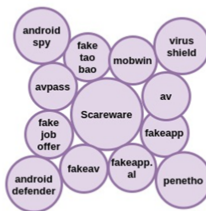
b) Scareware Families